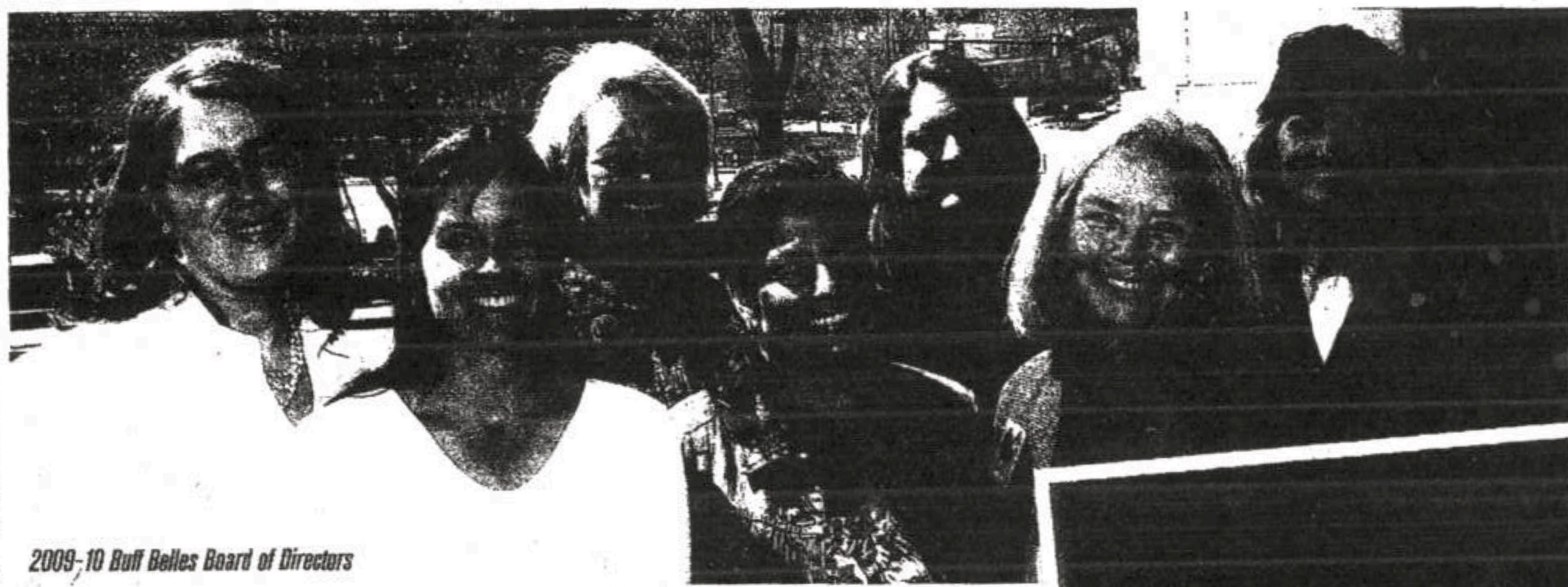
2009-10 Buff Belles Board of Directors

A group of unique and dedicated women support CU athletics